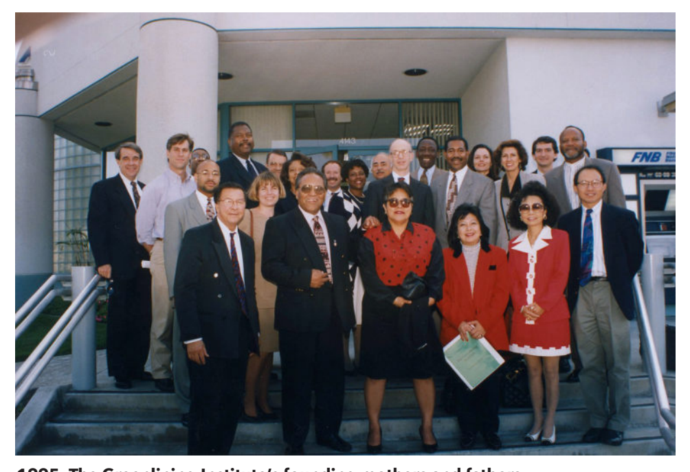
1995: The Greenlining Institute's founding mothers and fathers.